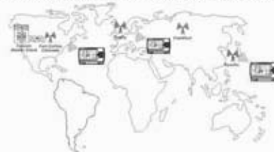
(Fig. 1 Atomic radio controlled time signal transmitters)

The transmitted signal is picked up by the radio receiver in your clock and it is decoded with a split second precision, to synchronize to the accurate time. At the same time, the radio signal automatically sets the calendar function and for countries adopting daylight savings and standard time, it adjusts automatically.