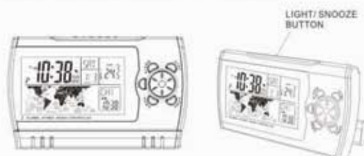
Fig.7a No back light on traveling position.

minutes of sleep, before the alarm sounds off again. This can be repeated 4 times, at 5 minute intervals, before the Alarm function is turned off.